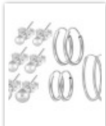
One set of small plain earrings allowed