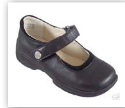
Acceptable black School Shoes