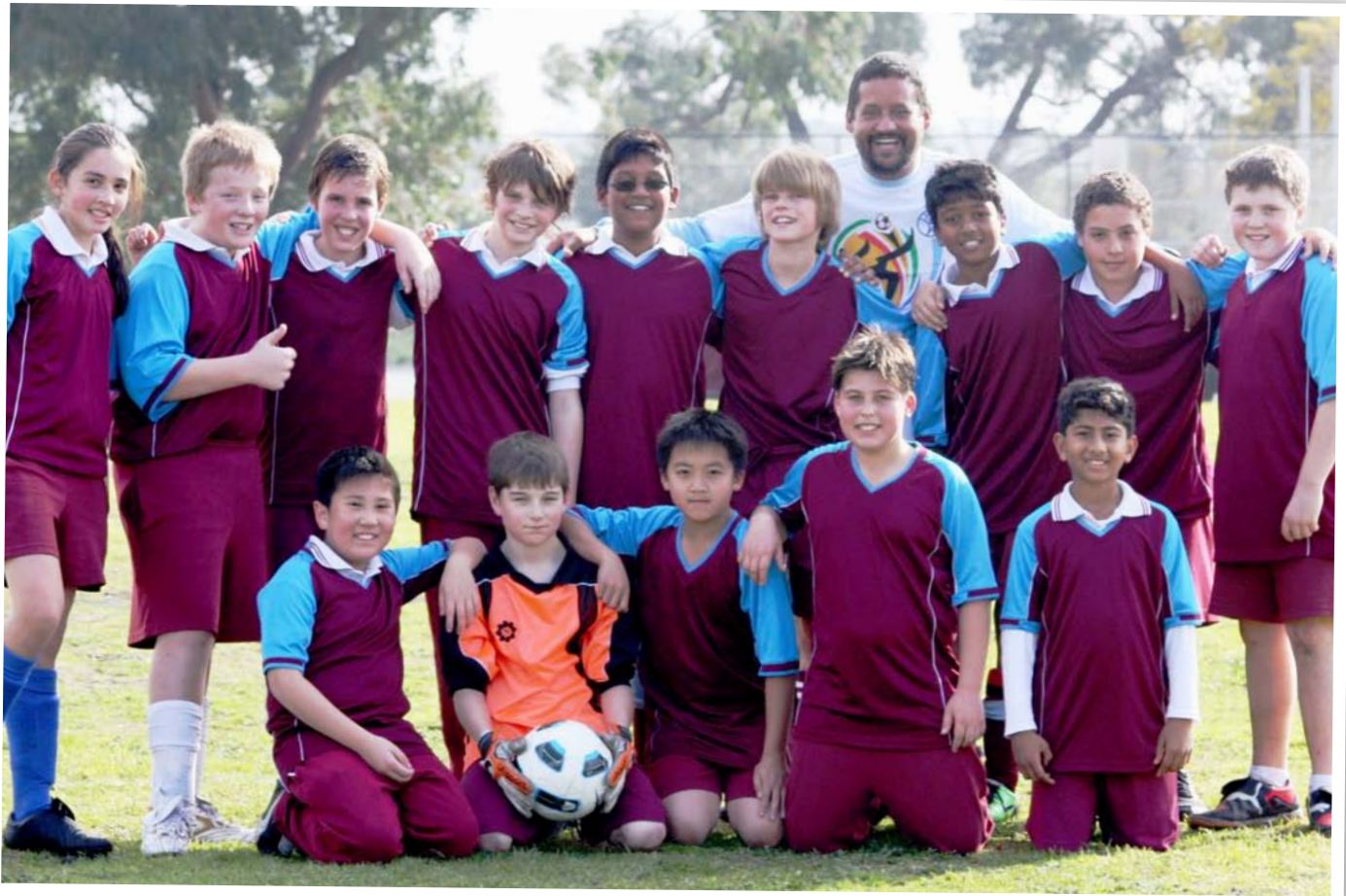
HCC provides competition singlets when needed