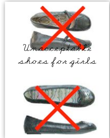
Unacceptable shoes for girls

Tattoos: Please ensure temporary tattoos are removed prior to attending school