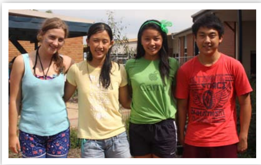
House Sport Colours