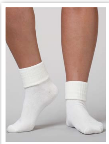
Girls summer white turn-down ankle socks

As a general rule summer uniform is to be worn throughout terms one and four and winter uniform is to be worn in terms two and three. In extreme weather conditions this rule is waived. For all formal school functions, correct seasonal uniform is to be worn.